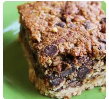
AFC Bakery Dream Bar Wheat-Free $10 50 lb