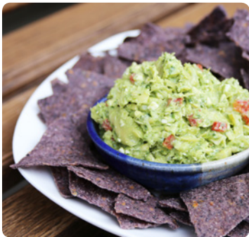
AFC Grab-n-Go Spinach Artichoke Dip $12 25 lb