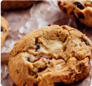
AFC Bakery Hooty Creek Cookies $1 95 ea

our deli offers delicious and nutritious food that hits the spot when you're on the go!